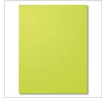
Lemon Lime Twist 8-1/2" X 11" Cardstock