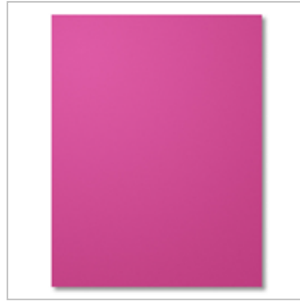
Berry Burst 8-1/2" X 11" Cardstock