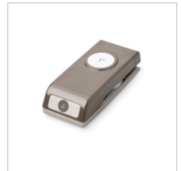
1" (2.5 Cm) Circle Punch