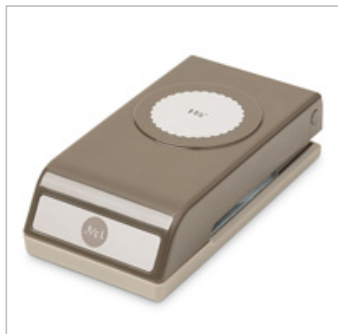
1-3/8" (3.5 Cm) Scallop Circle Punch