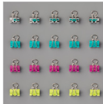
Birthday Mini Binder Clips