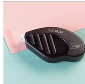
Fast Fuse Adhesive