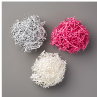
Sweet Soirée Ready