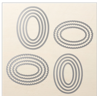
Layering Ovals Framelits Dies