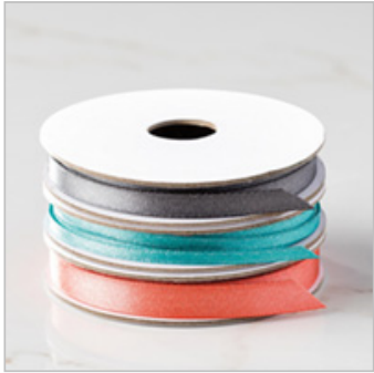
3/8" (1 Cm) Shimmer Ribbon Pack