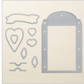
Lots To Love Box Framelits Dies