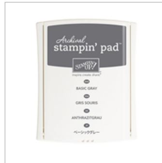
Basic Gray Archival Stampin' Pad