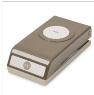
1-3/8\" (3.5 Cm) Scallop Circle Punch