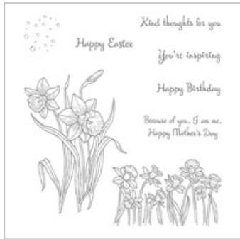
You're Inspiring Clear-Mount Stamp Set