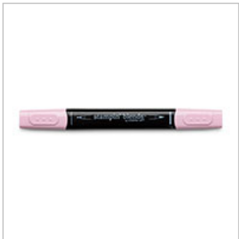
Pink Pirouette Dark Stampin' Blends Marker