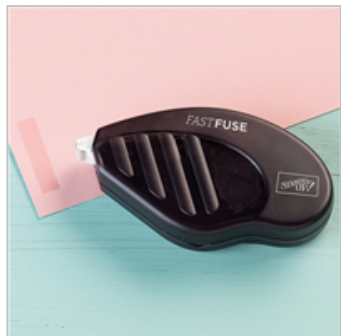
Fast Fuse Adhesive