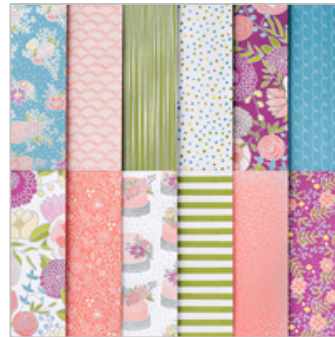
Sweet Soirée Specialty Designer Series Paper