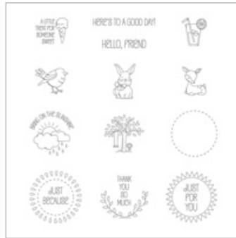
A Good Day Clear-Mount Stamp Set