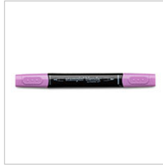
Rich Razzleberry Light Stampin' Blends Marker