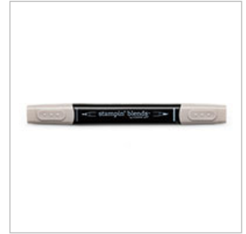
Crumb Cake Light Stampin' Blends Marker