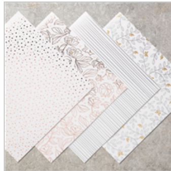
Springtime Foils Specialty Designer Series Paper