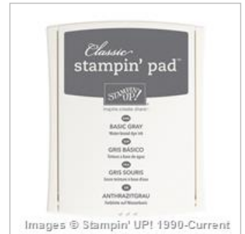
Basic Gray Classic Stampin' Pad