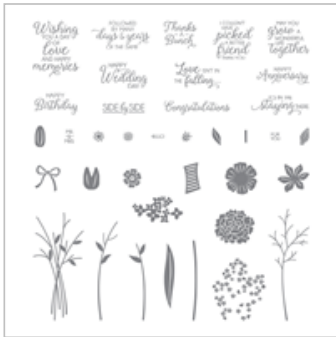
Beautiful Bouquet Photopolymer Stamp Set