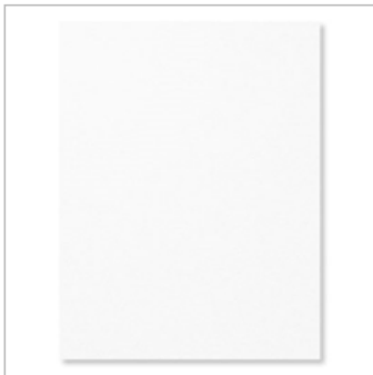
Whisper White 8-1/2" X 11" Cardstock