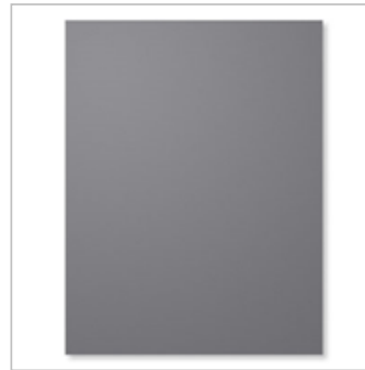
Basic Gray 8-1/2" X 11" Cardstock