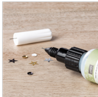
Fine-Tip Glue Pen