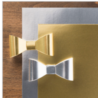
Silver Foil Sheets