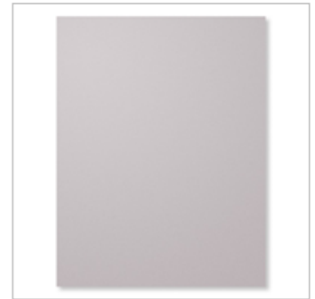
Smoky Slate 8-1/2" X 11" Cardstock