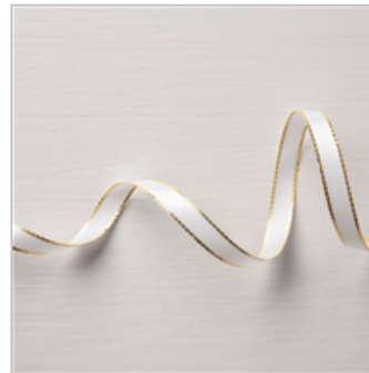
Gold 3/8" (1 Cm) Metallic-Edge Ribbon